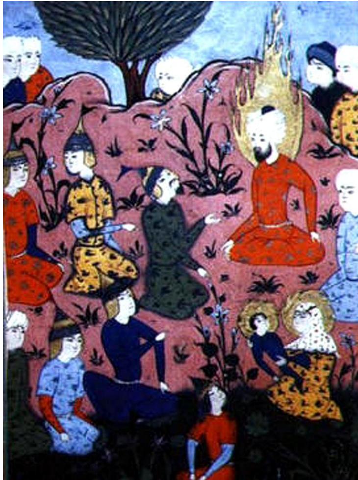
Anonymous 16 th -century Persian manuscript illumination (Sermon on the Mount)

Fourth Sunday After Epiphany February 1, 2026 at 9:30 AM