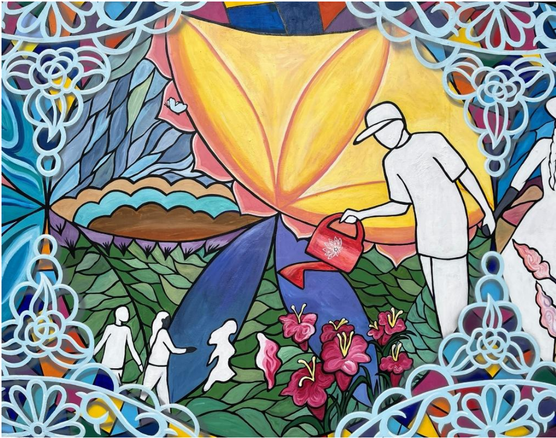
Memorial Wall at El Paso Healing Garden

2 nd Sunday of Easter Holy Humor Sunday Border Encounter Sunday April 12, 2026 at 9:30 AM