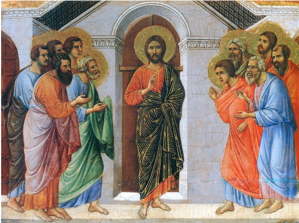
Duccio di Buoninsegna (c. 1255-1319), Christ Appears to the Apostles (1308) Museo dell'Opera del Duomo (Siena)

Third Sunday after Easter A Service of Eastertide Lessons and Carols April 19, 2026 at 9:30 AM