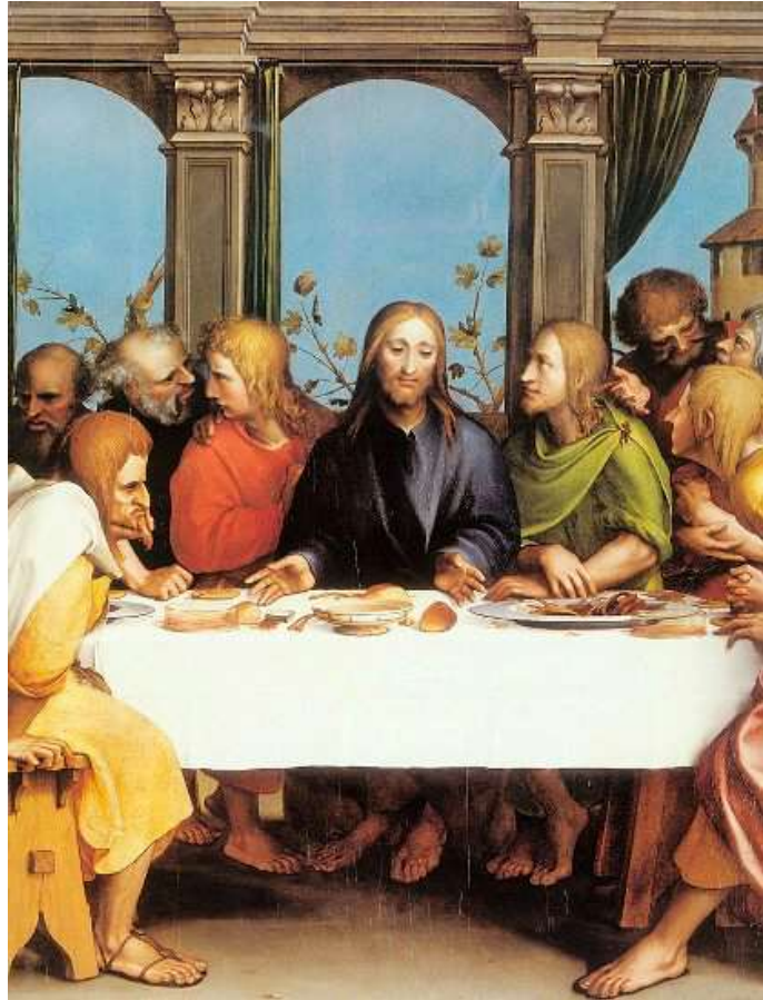
“Last Supper,” Hans Holbein, 1543.