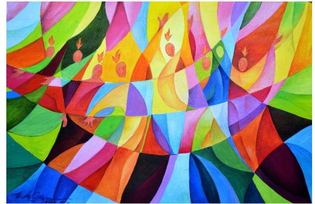
All of them were filled with the Holy Spirit

Instrumental Prelude: Prelude in F# Major, Op. 28 no. 13 - Frédéric Chopin (1810-1849)