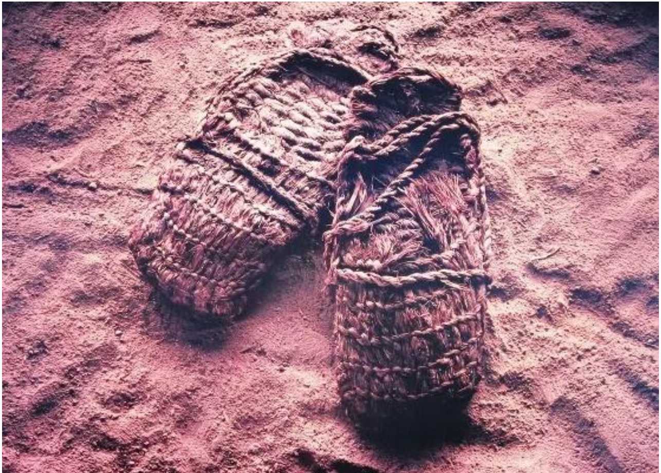
Great Basin Sandals | Museum of Natural and Cultural History, Eugene, Oregon

Second Sunday after Pentecost Communion Sunday June 7, 2026 at 9:30 AM