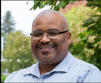
Chief Executive Officer Friends of MLK - Davenport