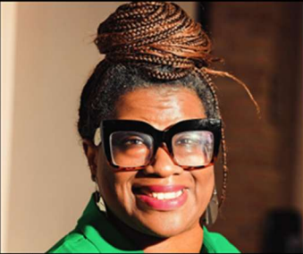
Speaker, Author, Preacher, Anti-Racism Coach