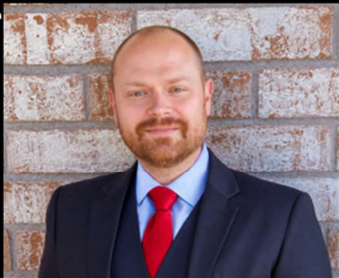
Pastor / Head of Staff First Presbyterian - Davenport

JOIN US FOR THIS FREE PROGRAM AT FIRST PRESBYTERIAN CHURCH OF DAVENPORT