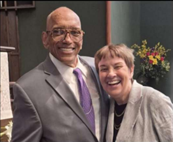
Members & Ruling Elders First Presbyterian - Davenport