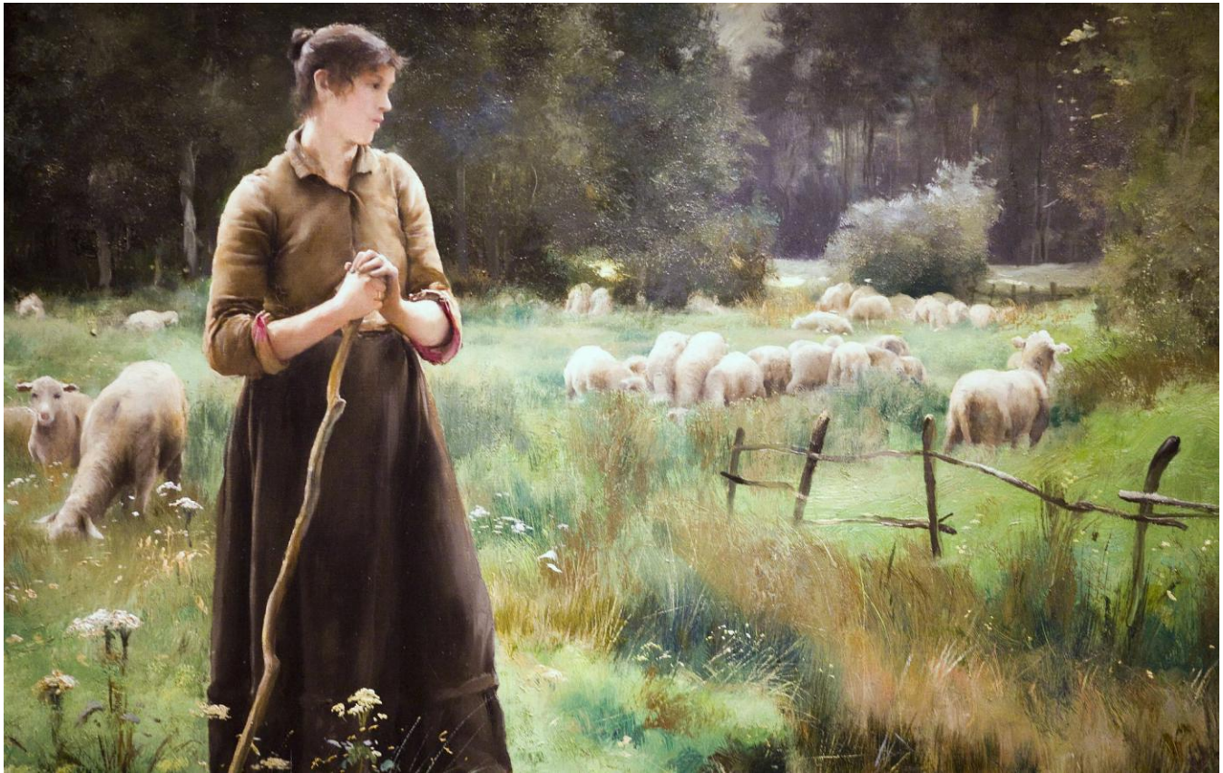
“The Good Shepherd,” Julien Dupre, 1910.