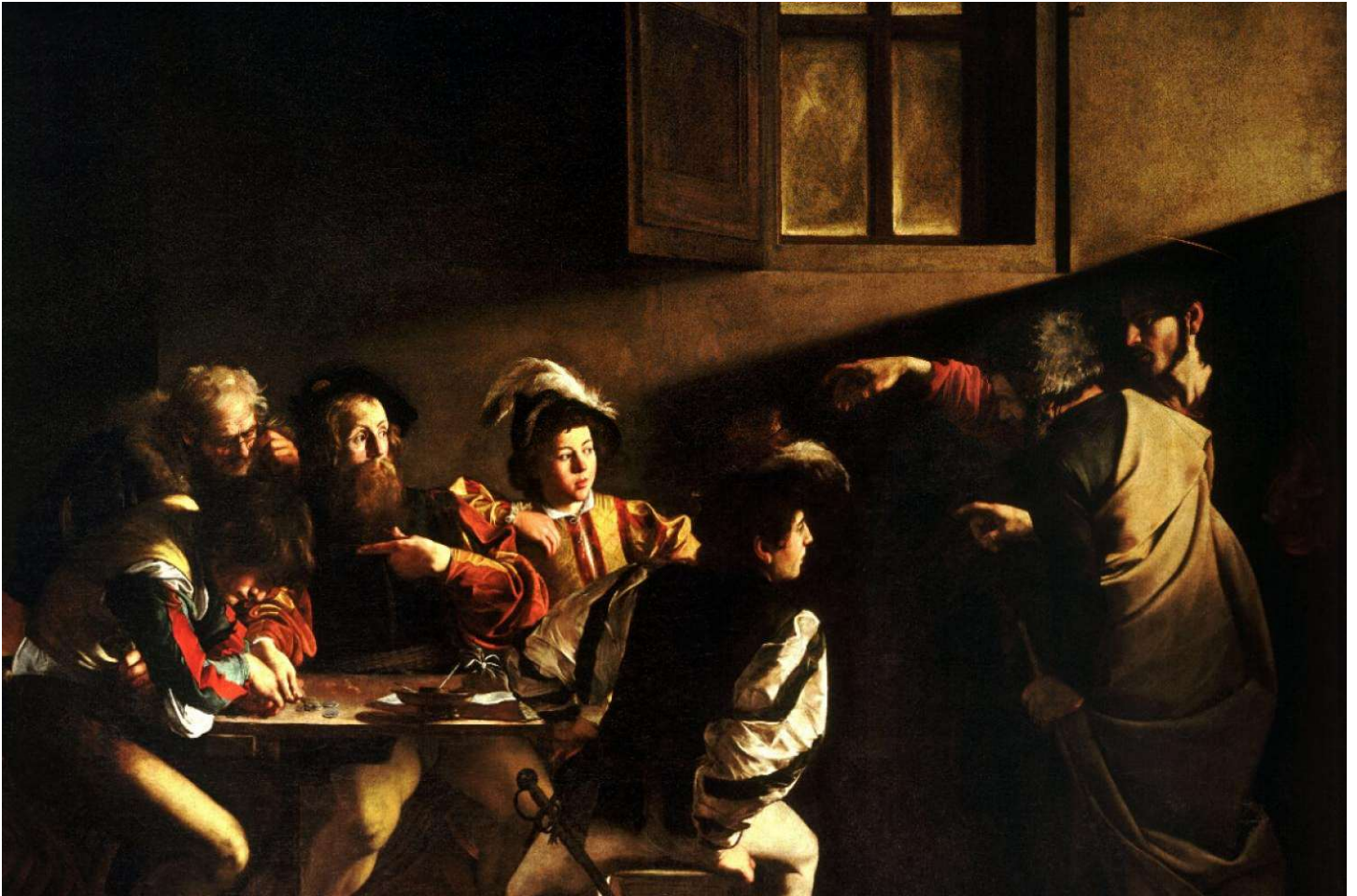
Caravaggio (1571-1610), The Calling of Saint Matthew (1599-1600) | San Luigi dei Francesi, Rome

Fifth Sunday after Pentecost June 28, 2026 at 9:30 AM