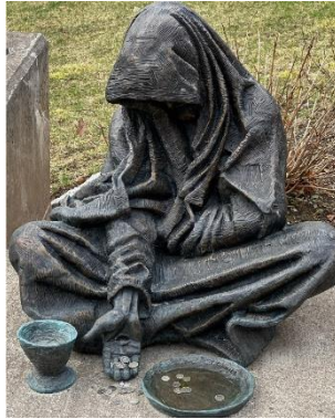
Sculpture by Timothy Schmalz

*As part of our Covid Protocols we dispensed with the practice of passing collection plates throughout the congregations. You will find offering plates at the front and side entrance of the Cathedral. We also have installed touchless “Tap” devices at the main entrance, or you may make electronic donations using the digital QR code below.