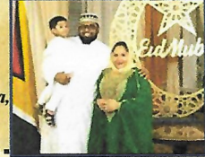
Dr Mohamed Irfaan Ali President of Guyana

"Guyana's population is made up of five main ethnic groups. Indians, Africans, Amerindians, Europeans (mainly Portuguese), and Chinese. Guyana continues to be influenced by British and Indian culture as well as the cultures of the United States, Europe, Africa, the Islamic world, East and South Asian countries, and Latin America, especially the neighboring countries of Venezuela and Brazil. Muslim Mosques and Krishna schools abound in Guyana." Courtesy of Caribbean Loop News