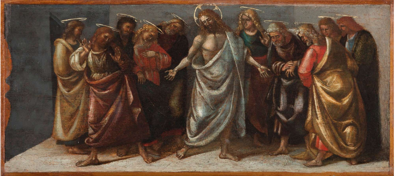
“Resurrected Christ Appearing to his Disciples” by Luca Signorelli, 1514