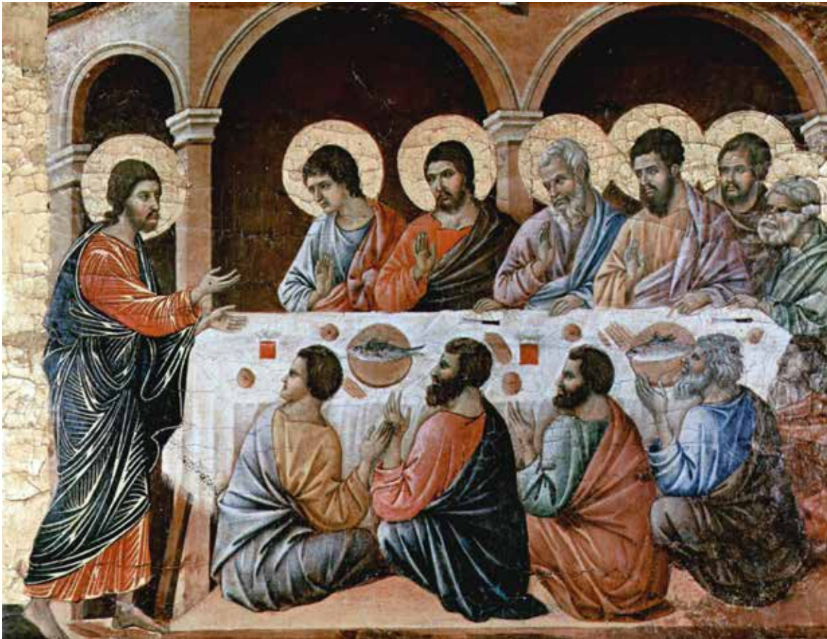
“Christ Appears to the Disciples at the Table after the Resurrection” by Duccio di Buoninsegna, c. 1311