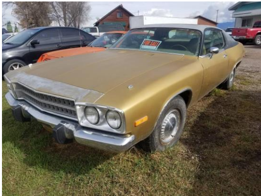
Plymouth Satellite before picture

He must remain in heaven until the time comes for God to restore everything, as he promised long ago through his holy prophets. Acts 3:21