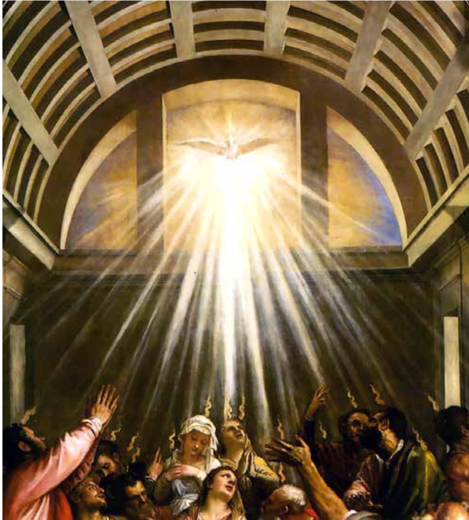
"Pentecost" by Titian, 1545