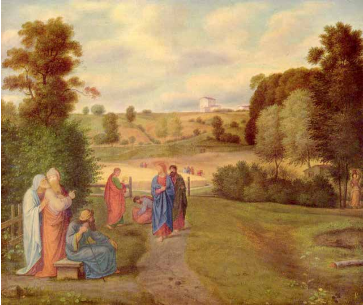
“Jesus with Disciples” by Ferdinand Olivier, 1840