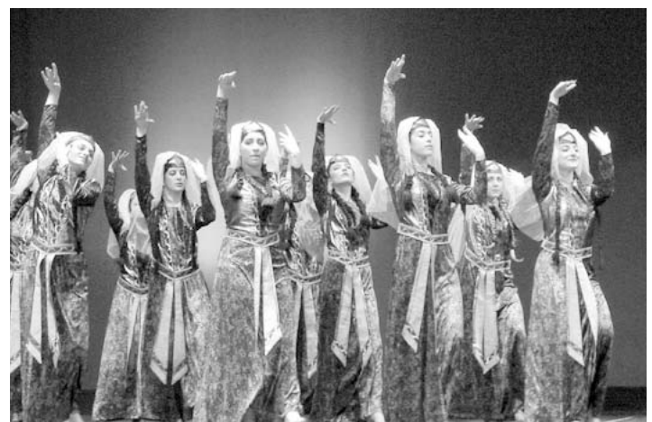
"Naz Bar" by Yeraz Dance Group