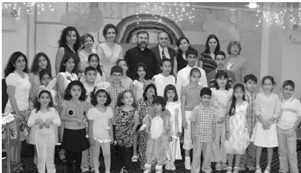
Sunday School Hantes

"Our Armenian Christian heritage had always had the Bible as the basis for teaching, our grandparents and our parents had used the lessons taught by the bible and made the book their resource for living, if that was good enough for them it is indeed good enough for us and our children who live in an age of turmoil."