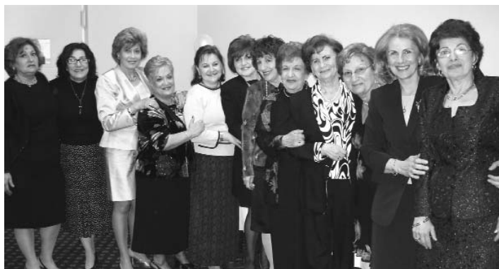
Ping-Pong Club Dance Committee

We look forward to a great season with good sportsmanship, in a healthy Armenian environment. Hopefully, we can bring a few new trophies to add to our collection, in addition to smiles and fond memories.