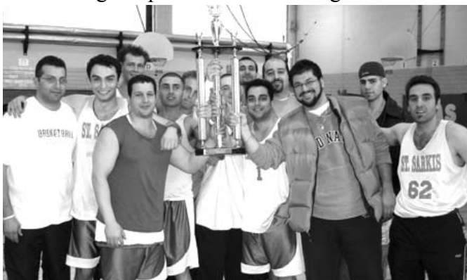
Saint Sarkis Mens Team - First Place

The Senior Boys team, is the team that shows the most energy, and started the season with a series of wins and good promise to be among the leaders in