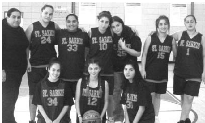
Saint Sarkis Girls Team

the division. Injuries and uneven play in the second half prevented the team from achieving their potential, the team starting strong in every game and losing concentration as the game progressed. We look