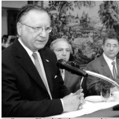
Senator Frank Padavan speaking at the 15th Anniversary Banquet