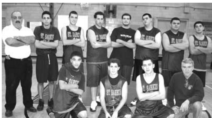
Saint Sarkis Senior Boys Team