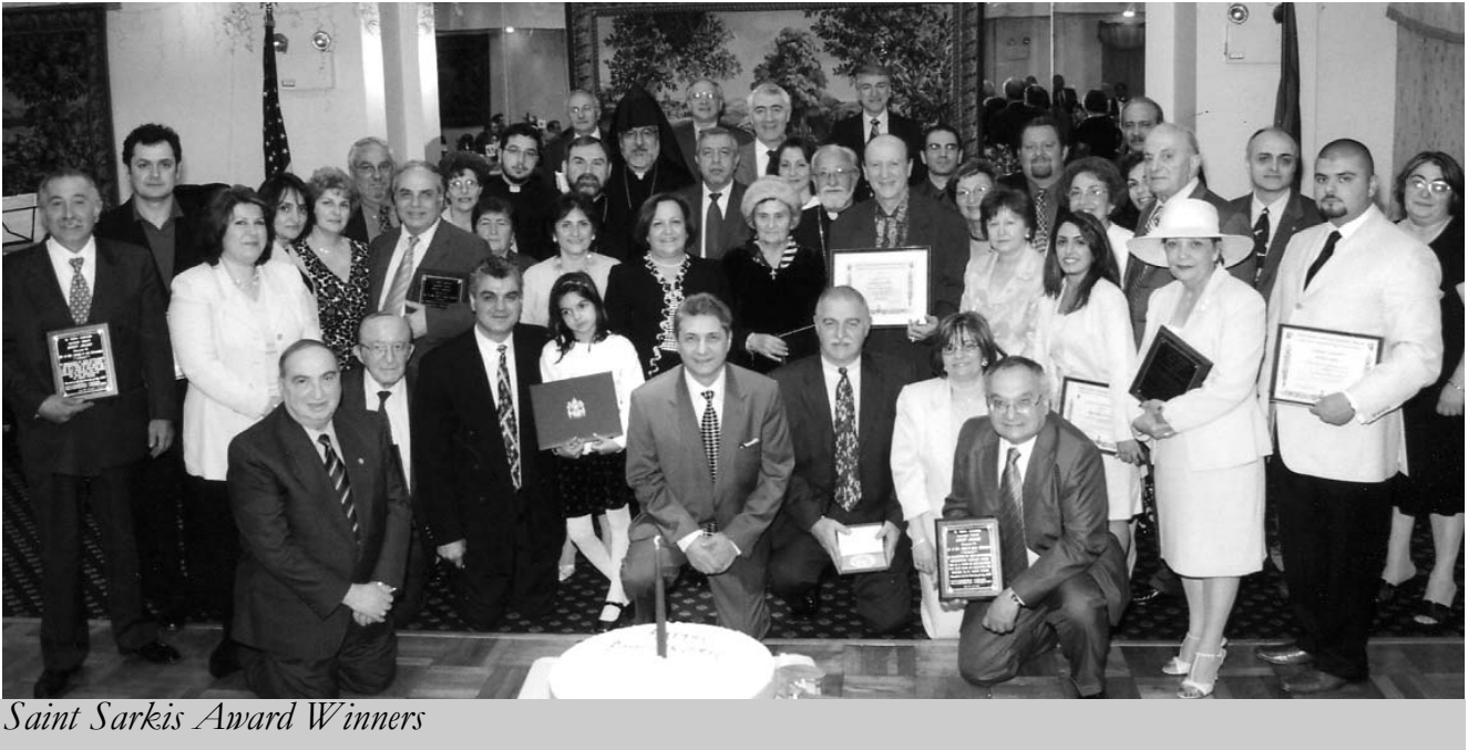
Saint Sarkis Award Winners