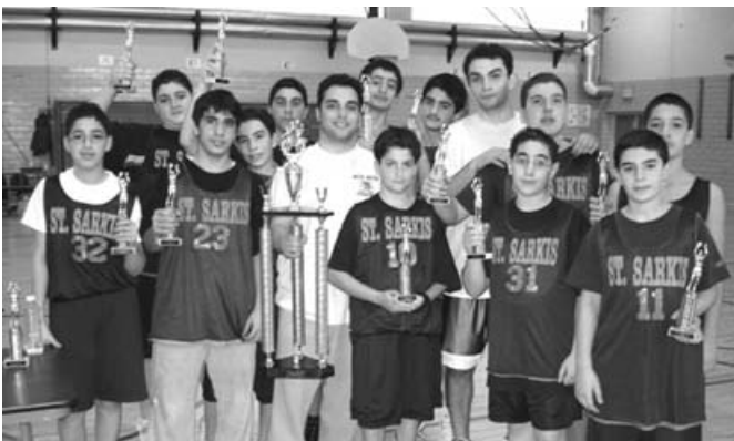
Saint Sarkis Juniors Team - First Place