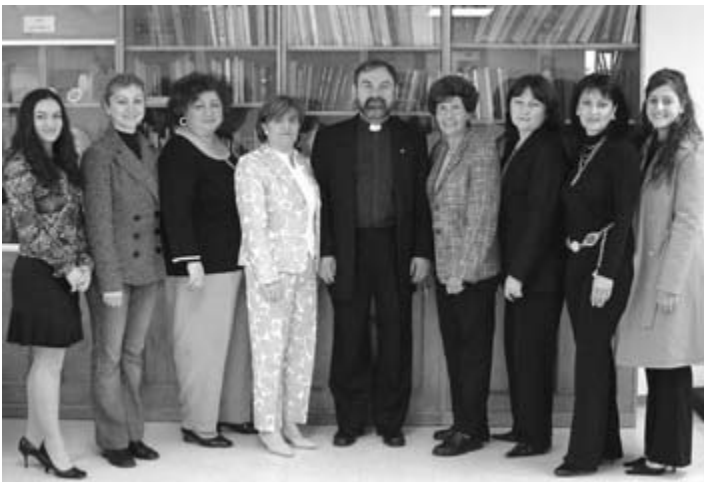
Teaching staff of Saturday School