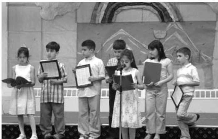
Sunday School Hantes