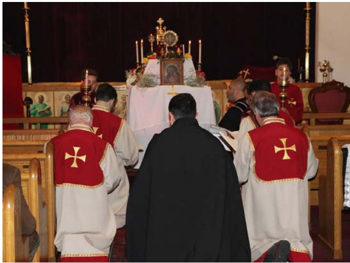
Քրիստոս Յարեալ Ի Մեռելոց Krisdos Haryav ee Merelotz Christ has Risen from the Dead