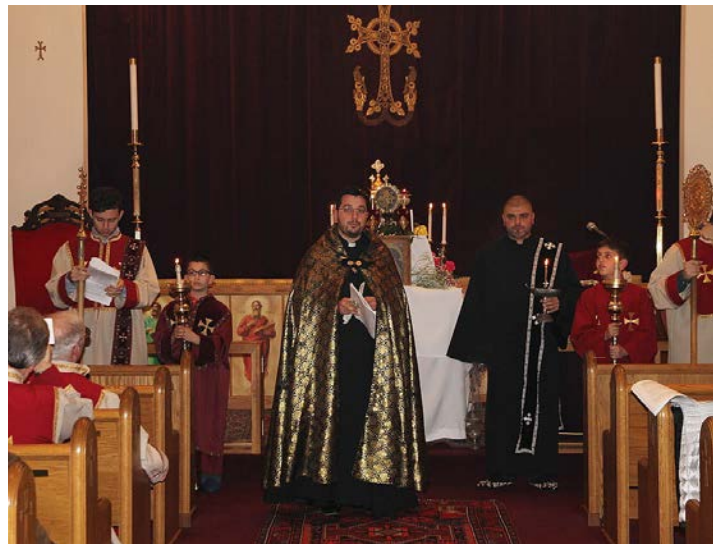
Օրհնեալ է Յարութիւնն Քրիստոսի Orhnyal eh Harootyoonen Krisdosi Blessed is the Resurrection of Christ