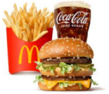
Big Mac Meal