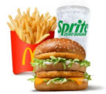
Chicken Mac Meal