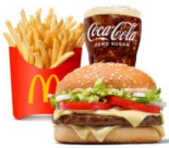
Big Tasty Meal