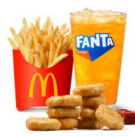
9 Pcs Chicken McNuggets Meal