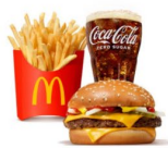
Quarter Pounder with Cheese Meal