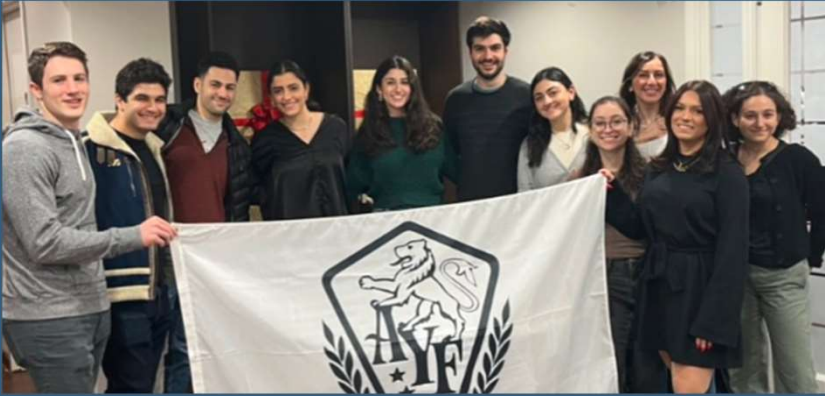
Hyortiks after their Winter Vernissage for Artsakh, St. Sarkis 2023