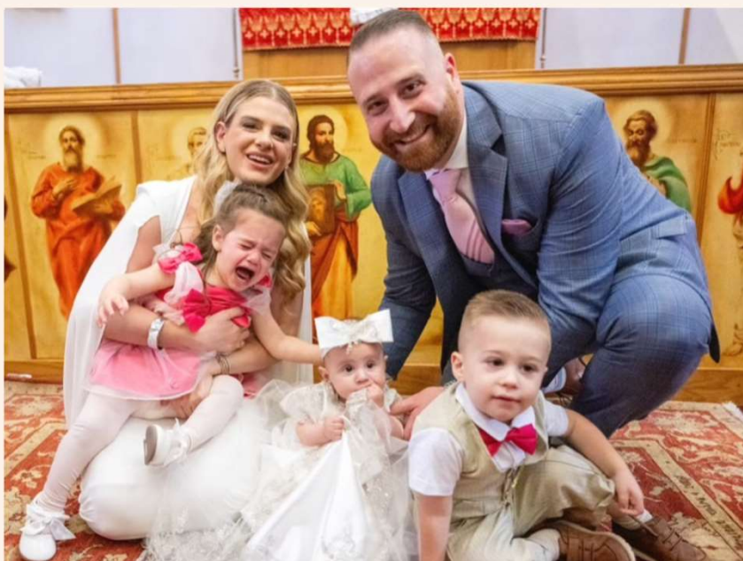
The Vitale Family celebrating after the Baptism and Confirmation sacraments, June 2023

These sacraments serve as a reminder that children are a gift from God and we must remain grateful for this blessing by dedicating our children to God.