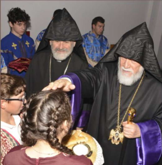
The Saturday School welcomes His Holiness Aram I

St. Sarkis Church welcomed His Holiness Aram I, Catholicos of the Great House of Cilicia, for a 2-day event in November 2023. A brief service was held on Friday, and on Saturday, a Youth Conference took place with over 80 attendees. The conference focused on enhancing youth participation in church life and fostering future leadership in the Armenian communities of North America.