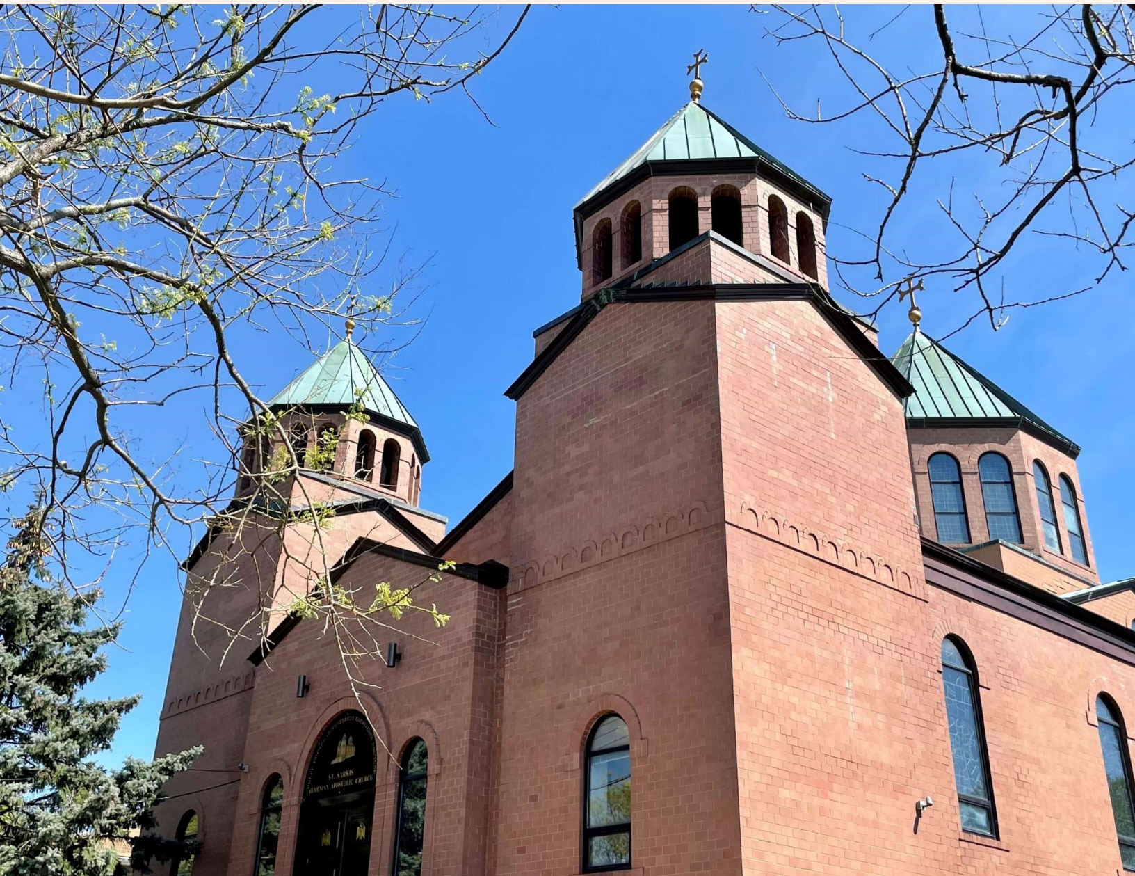
St. Sarkis Church Armenian Apostolic Church, a part of the Douglaston, New York community since 1990