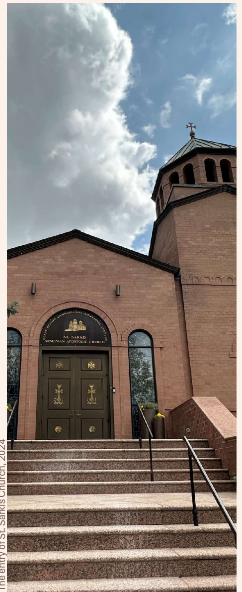
The entry of St. Sarkis Church, 2024

This council supports the pastor in his mission to develop and improve activities and programs that promote spiritual enrichment for parishioners of all ages.