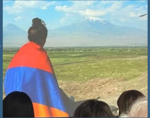
Movie Screening in Pagoumian Hall, 2023