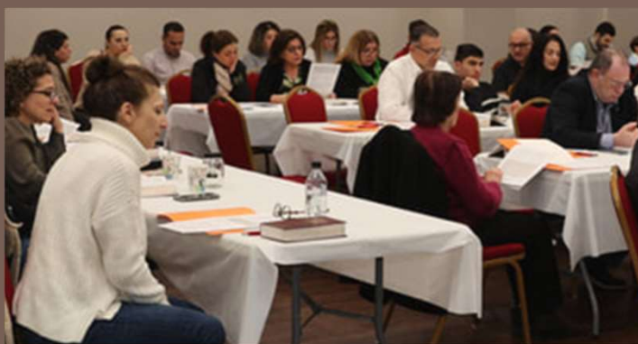
Redemption of the Cross workshop, Good Friday 2024

Adult education lays an essential foundation in nurturing faith at St. Sarkis Church. Programs such as “Get to Know the Bible in Six Weeks”, provide a comprehensive introduction to the Bible; from Old Testament to New Testament, including the Gospels, Acts of the Apostles and the Epistles. We also organize special events for parishioners, such as the “Redemption on the Cross” workshop. This program focused on typology in the Bible and the Seven Last Words of Jesus on the cross. Attendees left feeling inspired with a deeper spiritual understanding of Holy Week and God’s salvation. Fellowship and agape meals are valued parts of these programs, enabling parishioners to bond over shared learnings and experiences.