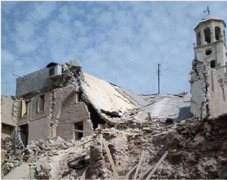
Aftermath of an earthquake that struck Aleppo, Syria, February 2023

We stood in solidarity with the Armenian community in Aleppo, Syria in the aftermath of the earthquake of February 2023. The community severely suffered the impacts of this devastating event. With conviction and determination, St. Sarkis parishioners and friends responded overwhelmingly with generous donations raising over $48,000 to aid the Armenian community in Syria.