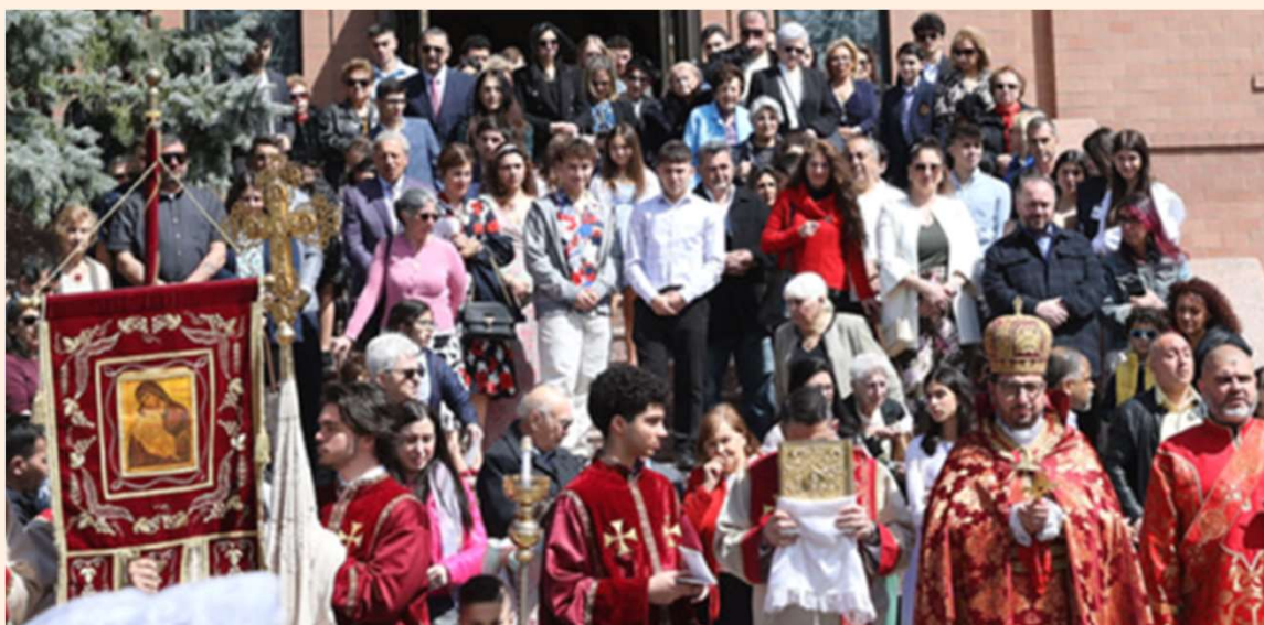
Easter Celebrations Outside St. Sarkis Church 2024

Within the Armenian Church, faith focuses on the Seven Sacraments of Baptism, Confirmation, Eucharist, Penance, Matrimony, Holy Orders, and Anointing of the Sick . Through the sacraments, God continues to bestow His grace upon us.