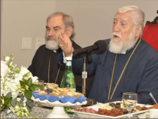
His Holiness answers questions at the reception

St. Sarkis Church welcomed His Holiness Aram I, Catholicos of the Great House of Cilicia, for a 2-day event in November 2023. A brief service was held on Friday, and on Saturday, a Youth Conference took place with over 80 attendees. The conference focused on enhancing youth participation in church life and fostering future leadership in the Armenian communities of North America.