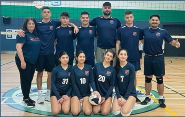
Homenetmen champion volleyball team at the Montreal games, 2023