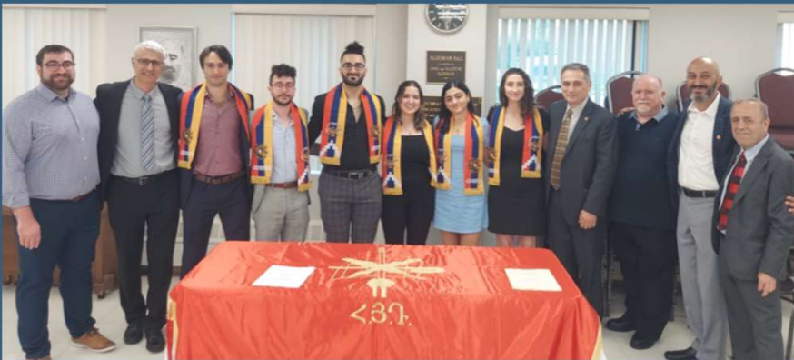
ARF New York Armen Garo Gomidehutyun, Pagoumian Hall 2023