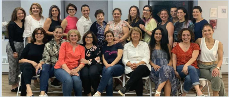
Ladies Guild St. Sarkis Church, June 2023

The Ladies Guild of St. Sarkis plays an integral part in our community. This creative, dynamic, engaged, dedicated, resourceful and multi-generational group takes the initiative to organize fundraising and community-building events