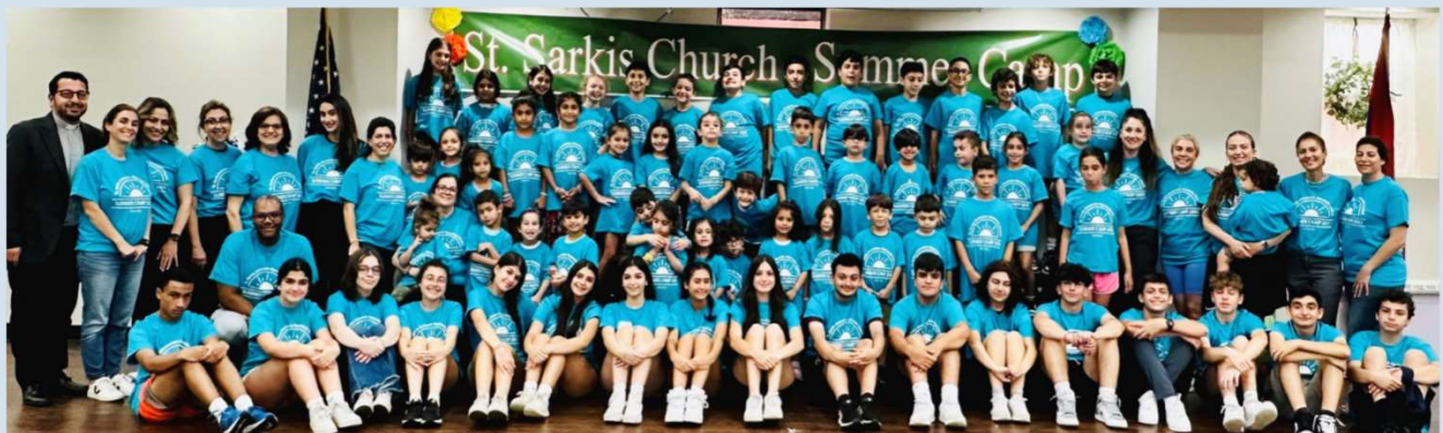
Summer Camp 2023 led by a passionate staff of adults and Counselors-in-Training, St. Sarkis Church

Sunday School provides a spiritual introduction for young parishioners. Our students learn about the bible and attend Badarak to attain a better understanding of our Armenian Apostolic Christian Faith in a fun and supportive environment.