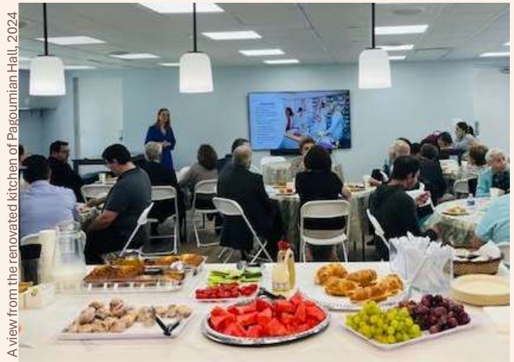
A view from the renovated kitchen of Pagoumian Hall, 2024

We took prudent action such as establishing tax-exempt accounts, moving cash reserves to a low-risk money market fund and opening a business credit card. We revised the hall rental contract agreement and started advertising hall rentals as a means of additional income for our church. Finally, we made legal changes to the Union Turnpike properties to mitigate future risk.