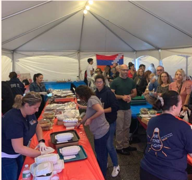
St. Sarkis Food Drive to Benefit Artsakh, September 2023

As the tragic events in Artsakh intensified in 2023, the Pastor, Board of Trustees, and Picnic Committee of St. Sarkis decided to change the annual picnic to a gathering where the community could mourn and pray for the lives lost and displaced in Artsakh. Despite heavy rains, record crowds came and showed their solidarity and support.