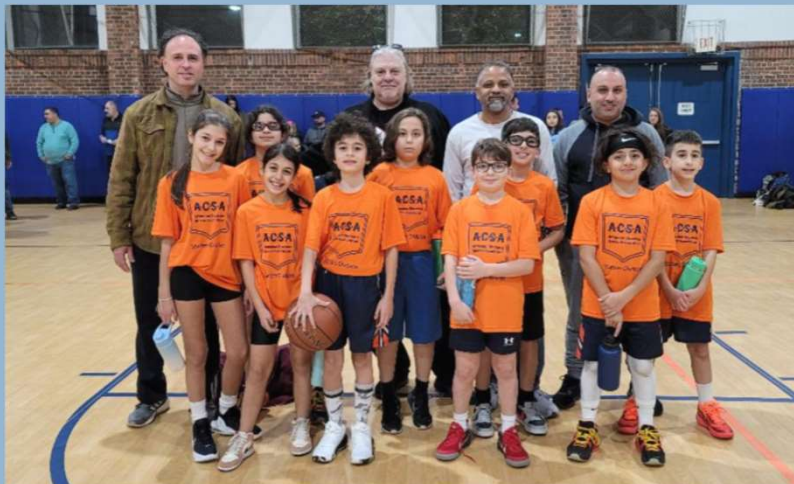
The St. Sarkis co-ed Starters Basketball team with their coaches and general manager, 2023

Players have fun learning basketball skills and developing a love of the game in a safe and supportive environment. The program includes Junior Boys and co-ed Starters teams. We welcome new players and hope to form Senior Boys and Girls teams in the future.