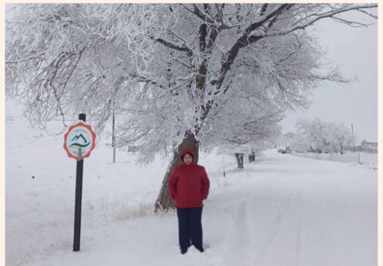
A recipient of a donation from the St. Sarkis Coat Drive, Armenia, February 2024

St. Sarkis Church collaborated with Lorens NYC to produce high-quality winter coats in Armenia for displaced Artsakh Armenians. The Armenian Prelacy’s St. Nerses the Great Charitable Organization in Yerevan handed the coats directly to the Artsakh displaced Armenians. Our community’s generosity made this initiative a great success raising $27,500.00 for 550 coats while bringing manufacturing jobs to Yerevan.