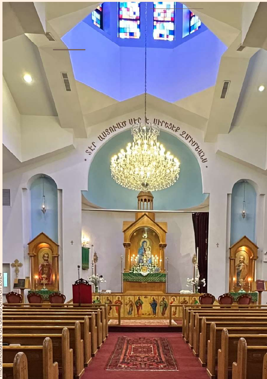
The sanctuary of St. Sarkis Church 2024