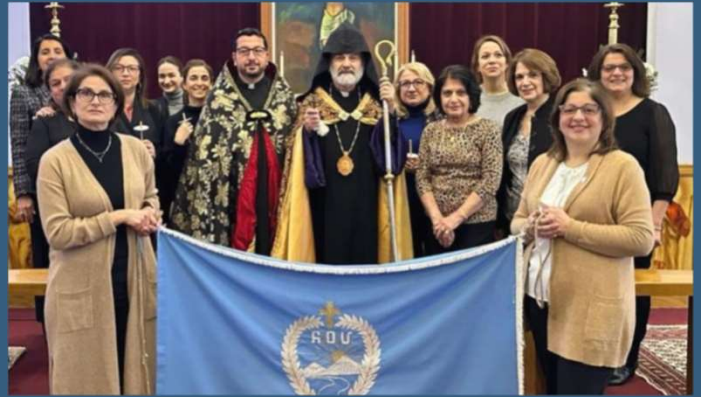
Armenian Relief Society Erebouni Chapter, St. Sarkis, 2023