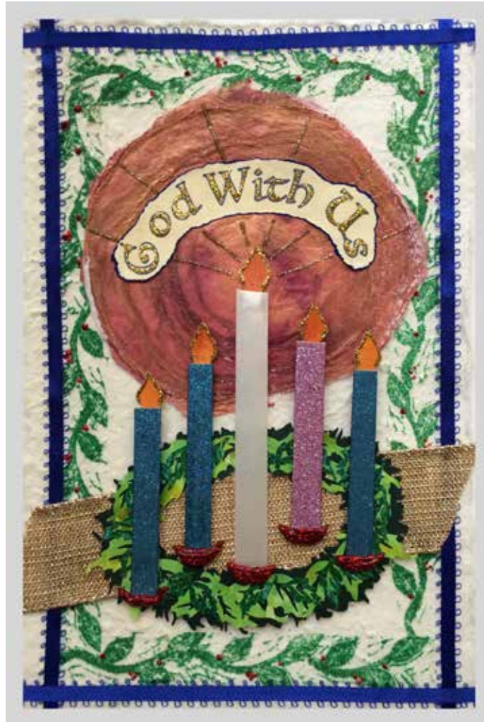
Art by Sue Carroll