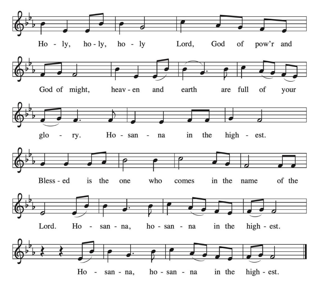
*Eucharistic Prayer and Words of Institution