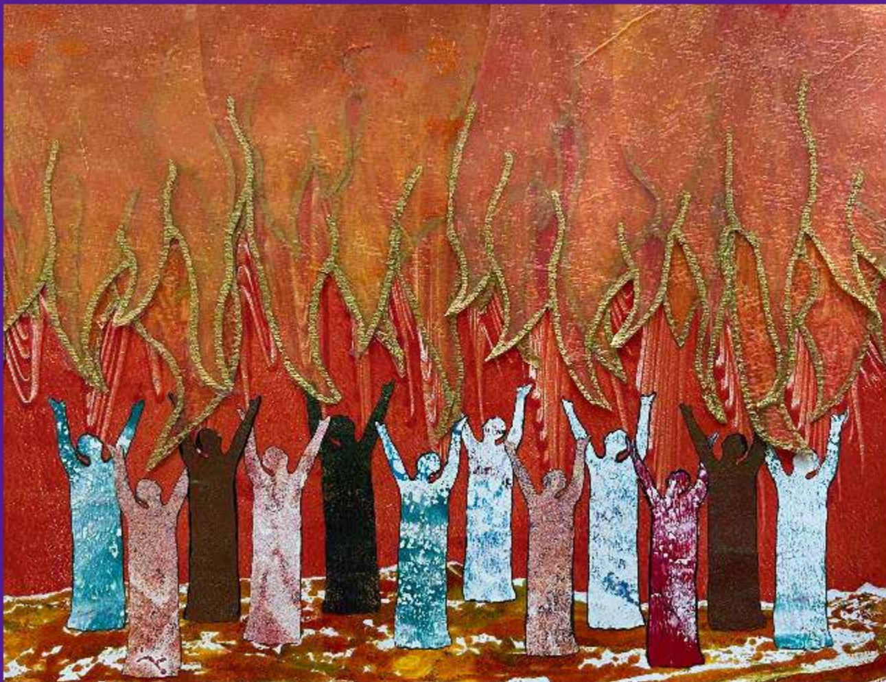
“Fire Appeared Among Them” by Sue Carroll