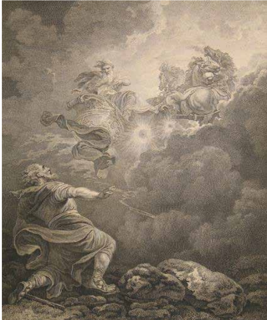
“The Ascent of Elijah” from The Macklin Bible, 1791