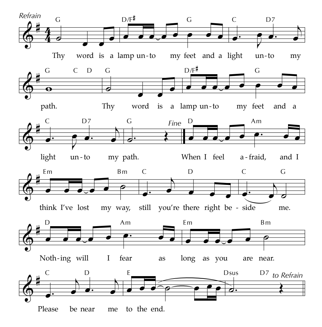
Thy Word is a Lamp