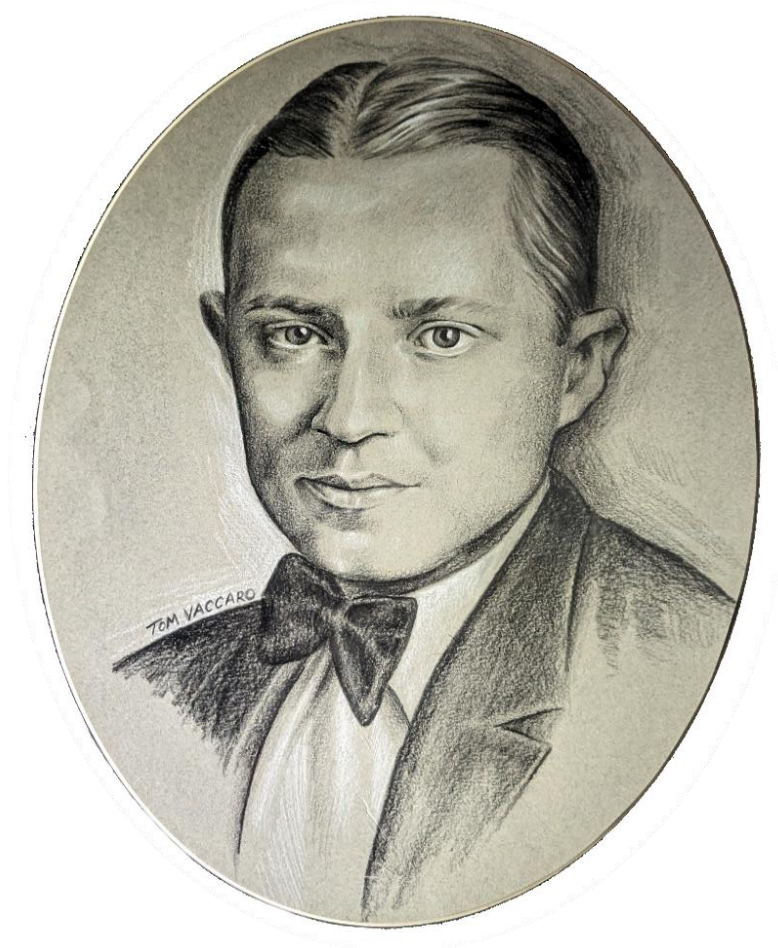
Bix Beiderbecke

Eighth Sunday After Pentecost Bix Jazz Sunday August 3, 2025 at 9:30 AM