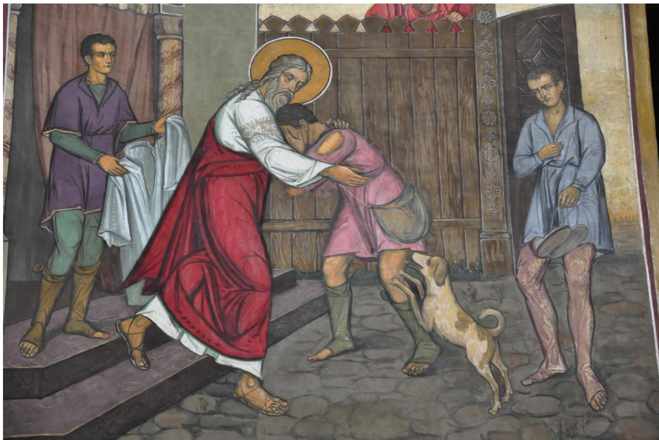
Anonymous ikon, Brasov, Romania

Ninth Sunday After Pentecost Communion Sunday August 10, 2025 at 9:30 AM